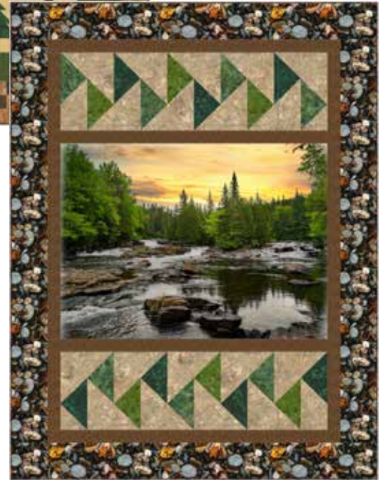
In Flight: 56" x 73" by Quilting Renditions