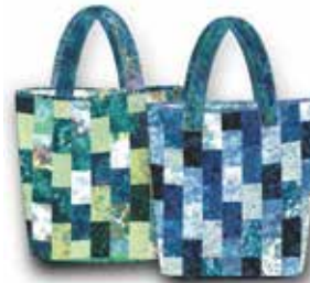
Market Totes (MT) Wade Colorway