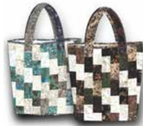
Market Totes (MT) Seashell Colorway