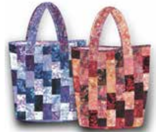
Market Totes (MT) Blooms Colorway