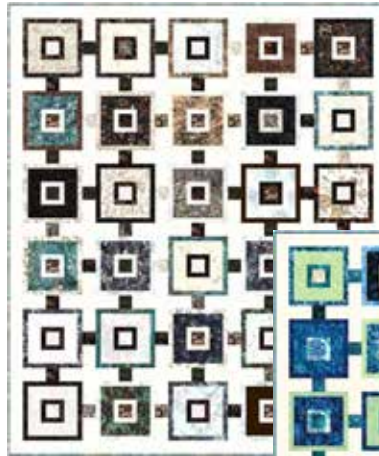
Scrappy Squares (SS): 57" x 68" Seashell Colorway

Get scrappy with these fun squares made easy with pre-cut strips!