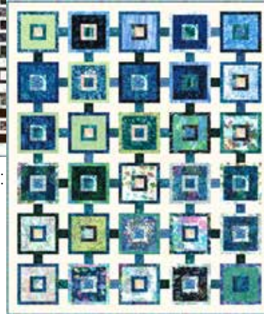
Scrappy Squares (SS): 57" x 68" Wade Colorway