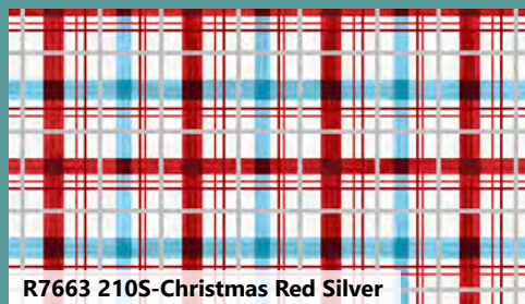
R7663 210S-Christmas Red Silver