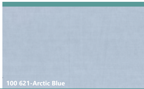
100 621-Arctic Blue