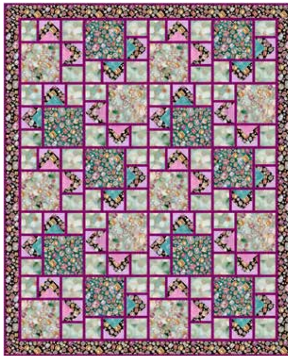
Throw: 58" x 68 1/2"

Dance with the jewels and add more color to your world!