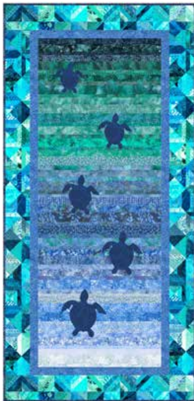
Turtles to the Sea: designed by Castilleja Cotton