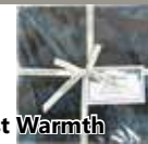
BC 732-Harvest Warmth