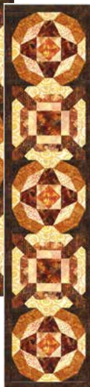
Runner: 14" x 62"