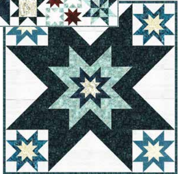
Repeat: 66" x 66"