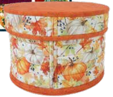
AT660 Covered Round Crates by Aunties Two