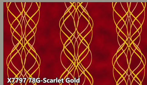
X7797 78G-Scarlet Gold