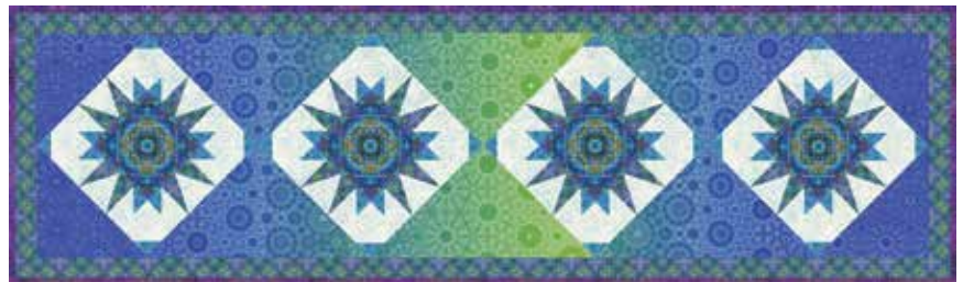
Runner: 20" x 71"