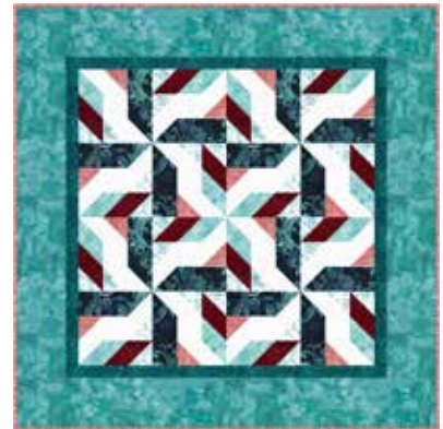
Topper: 34" x 34"