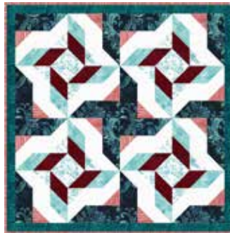
Topper: 26" x 26"