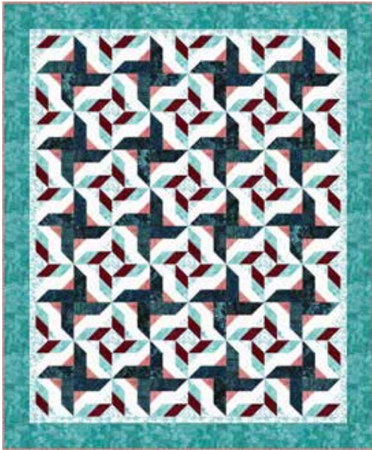
Throw Quilt: 58" x 70"

A fun project made with strips. Simply rotate block units to create 4 layout options. Choose your favorite or make several!