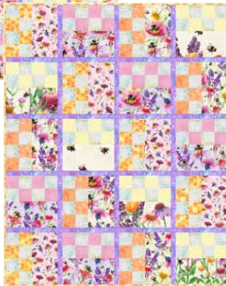
Baby: 35" x 44"