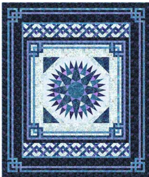
Queen: 90" x 106"