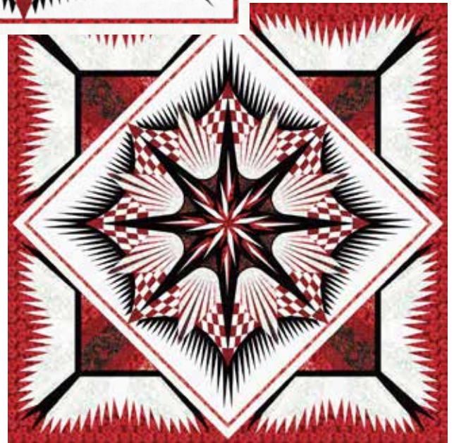
Queen: 99" x 99"