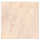
1895 501-Sand Dollar 1/4 Yard