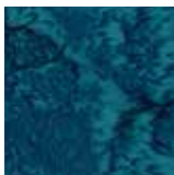
1895 239-Persia 1/8 Yard