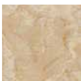
1895 485-Funnel Cake 1/8 Yard