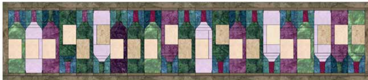
Table runner finishes at 65” x 14”

Press, then add batting and backing and quilt as desired. Attach binding.