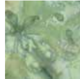
1895 227-Sprout 1/4 Yard