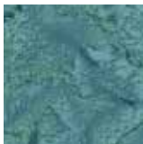
1895 538-Nirvana 1/4 Yard