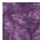
1895 46-Plum 1/4 Yard