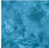
1895 311-Lake 1/8 Yard