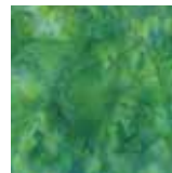
1895 377-Spinach 1/4 Yard