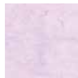
1895 30-Lilac 1/4 Yard