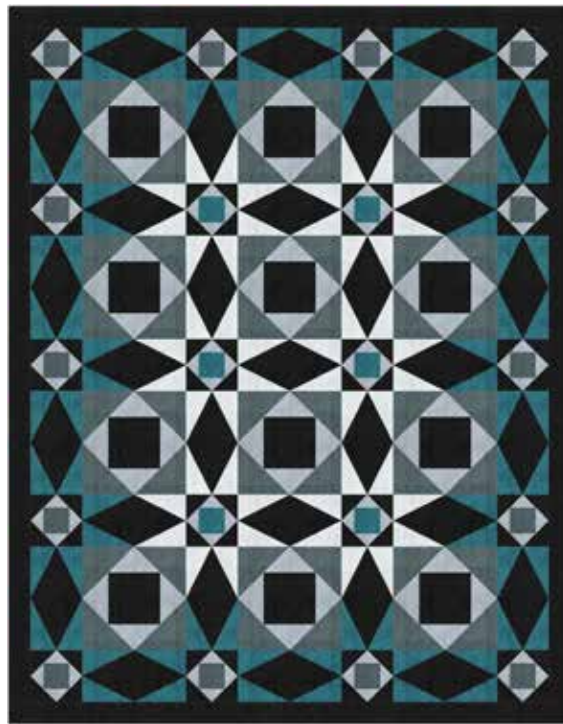
Throw Quilt: 54" x 69"