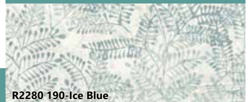
R2280 190-Ice Blue