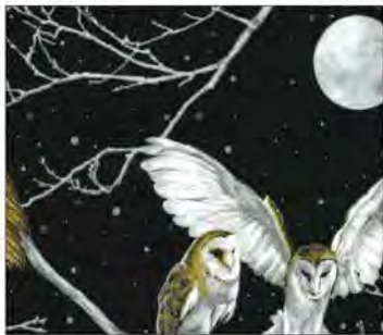
P7591 4S-Black Silver