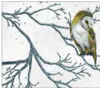
P7591 483S-Fog Silver