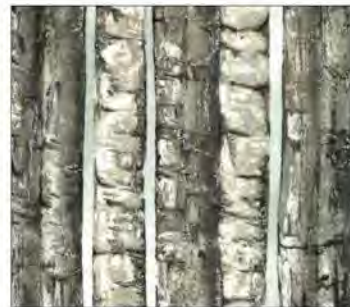
P7594 126S-Birch Silver