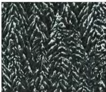
P7595 92S-Slate Silver