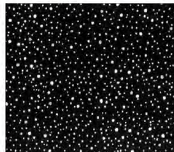
L7360 4S-Black Silver