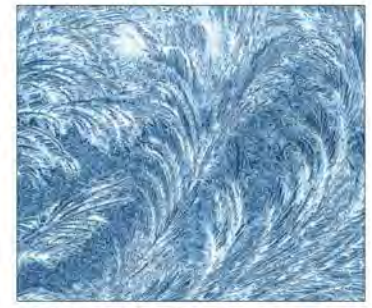
P7592 190S-Ice Silver