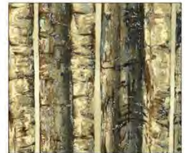
P7594 642S-Sepia Silver