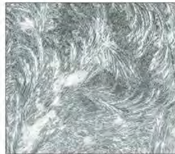
P7592 48S-Gray Silver