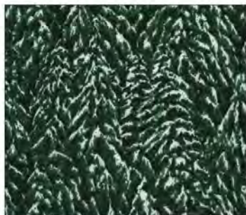
P7595 141S-Pine Silver