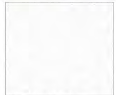
G8555 3S-White Silver