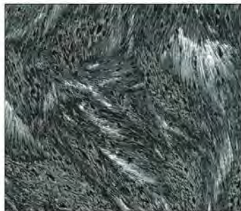
P7593 654S-Dark Gray Silver